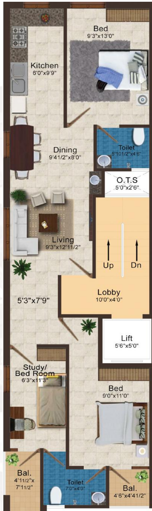
TYPICAL FLOOR PLAN - I, II & III